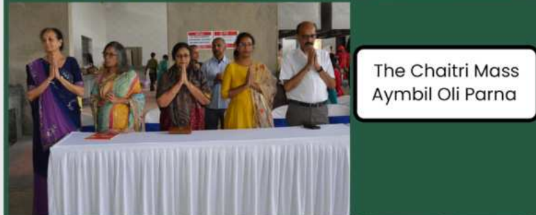
The Chaitri Mass Aymbil Oli Parna