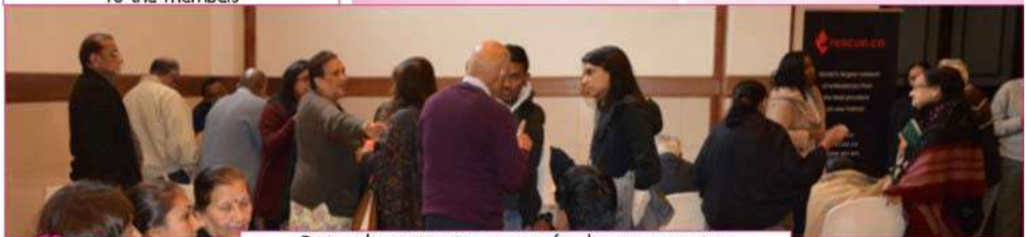
During the registration process for the rescue services