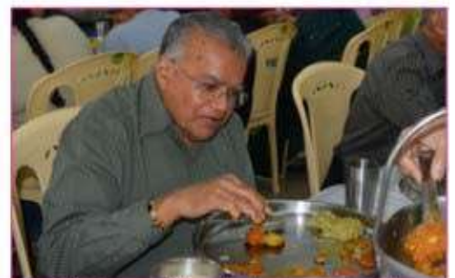
Kathiawadi lunch being enjoyed

The Senior Social Committee of Visa Oshwal Community held an Antakshri Program on Thursday, 19th July 2018 at the Visa Oshwal Mahajanwadi, Limuru Road.