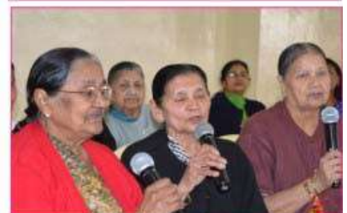
The challenge continues