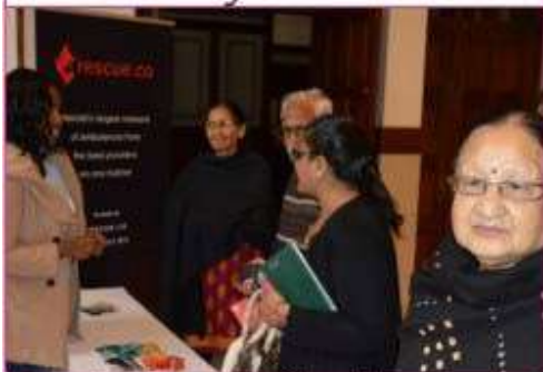
Details of services offered being given To the members

An exciting partnership with rescue to give Oshwal members an exclusive discount on life saving services.