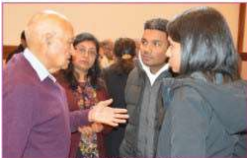
Volcing of concerns