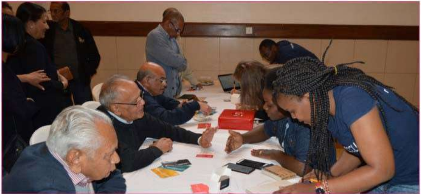
Members of the community signing up for rescue.