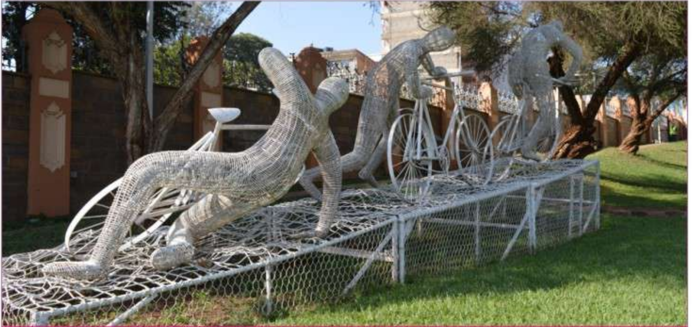
We rise to the challenge

OSHWAL ACTIVITIES JULY 2018 - NAIROBI, KENYA