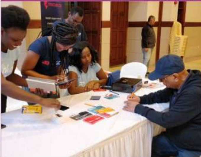
Partnership with rescue

OSHWAL ACTIVITIES JULY 2018 - NAIROBI, KENYA