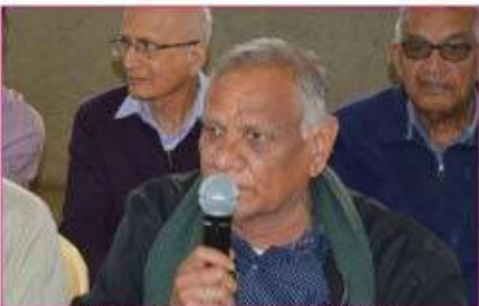
Reminiscence of old tunes

A vote of thanks was given to all the seniors and a word of encouragement to always participate