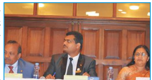
The Chairman and Vice Chairman of OERB & Honorary Secretary of VOC