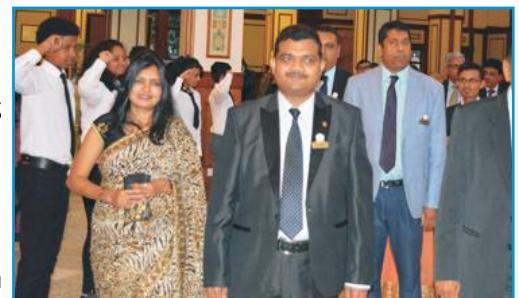
OERB - Guard of Honour