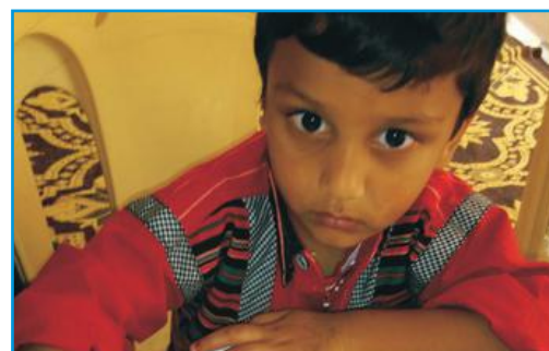
Library Committee supports young ones