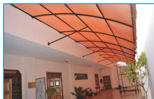
After Renovation of the Library area

Gold Ticket Challenge To encourage our younger members to read books they ordinarily wouldn't pick & to ensure they are members of the library. They check out the book that has a "Golden ticket" inside it, and they get to win a prize from the lucky dip. This activity is for young readers aged between 6 to 10 years and they must be members of the Library to be able to win a prize from the lucky dip.