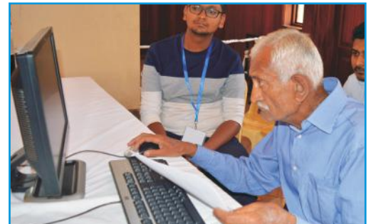
Casting his vote with the computer

The queues were not long and the services were superb!