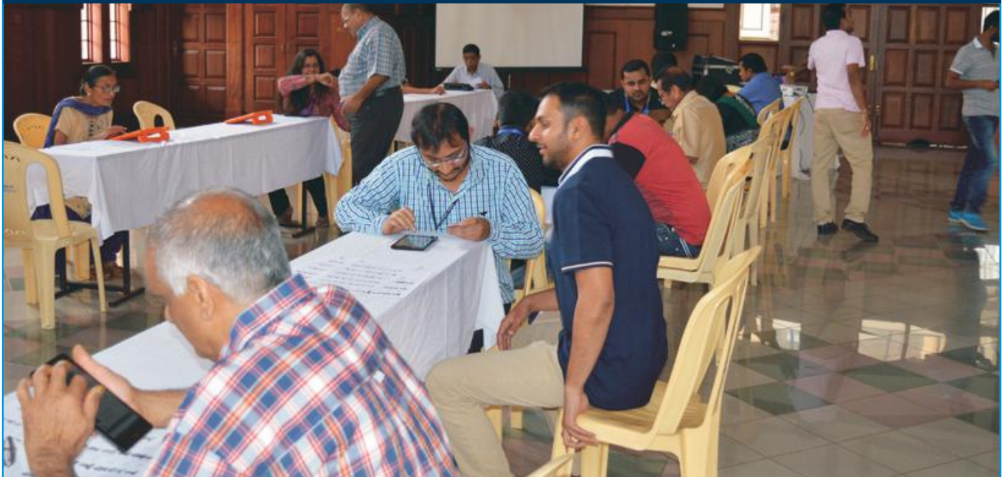
DURING THE ANNUAL GENERAL MEETING AND THE ELECTIONS - VOTING HALL