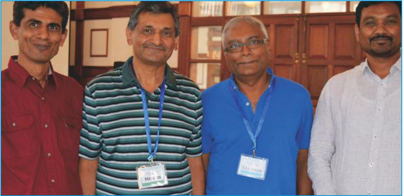
Standing Orders Committee