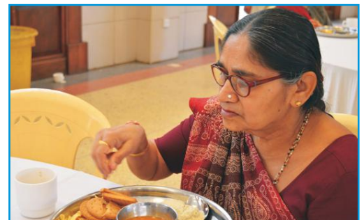
Refreshments after Voting Exercise