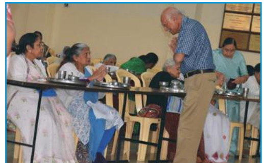
Thankful for the Aymbel