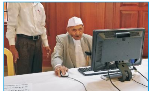
Even the Elderly were not left out!