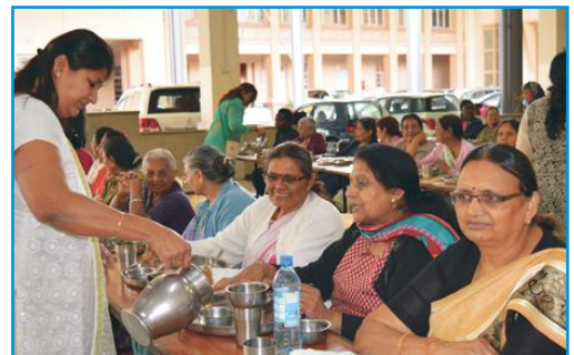
Serving the Aymbel participants