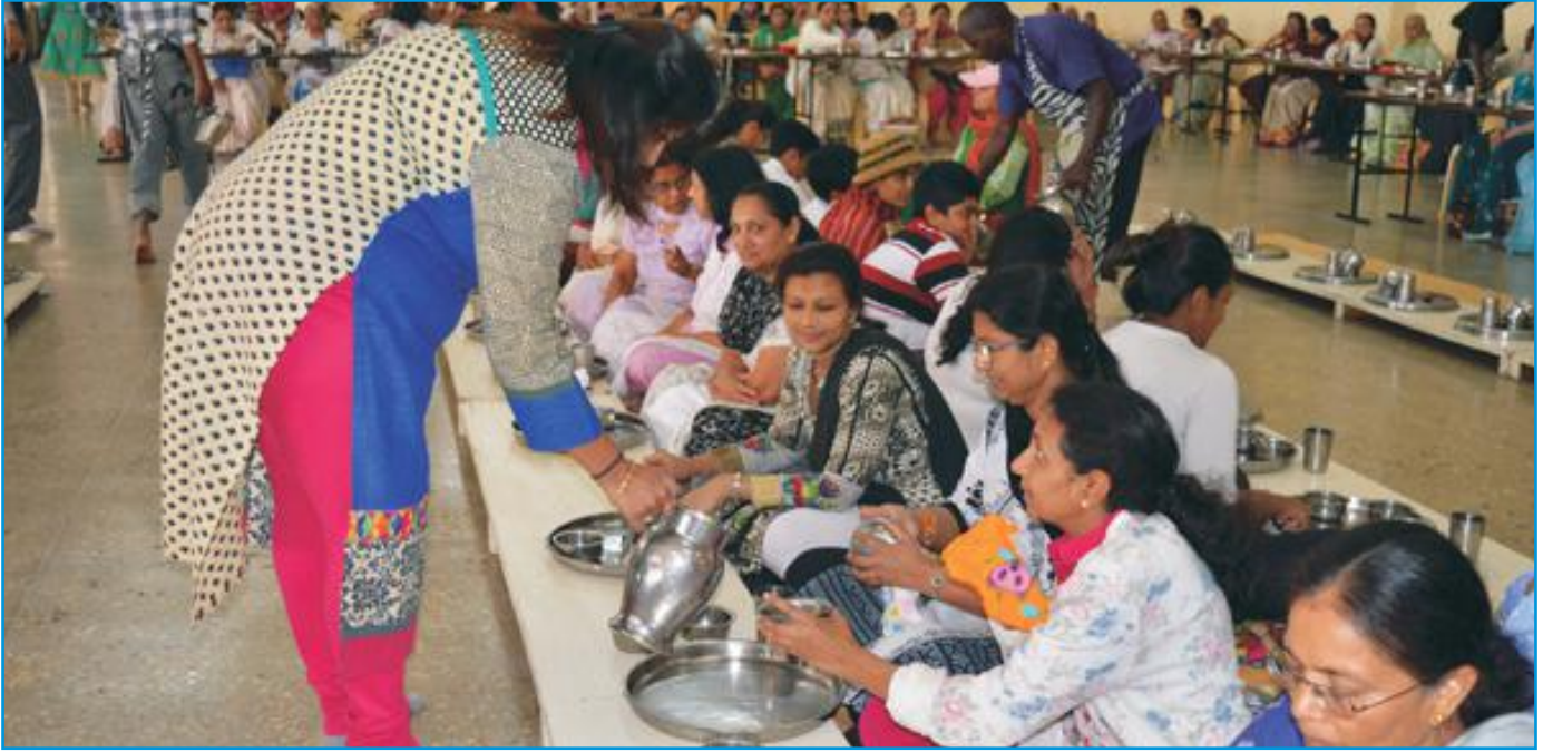
During the Aymbel at the Mahajanwadi Temple in Nairobi, Kenya