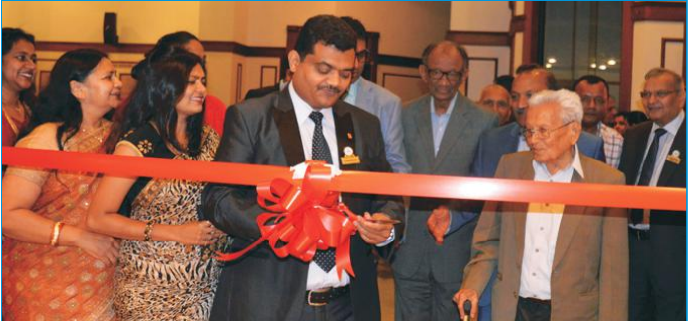
Official Opening of the Annual Delegates Meeting by the OERB Chairman