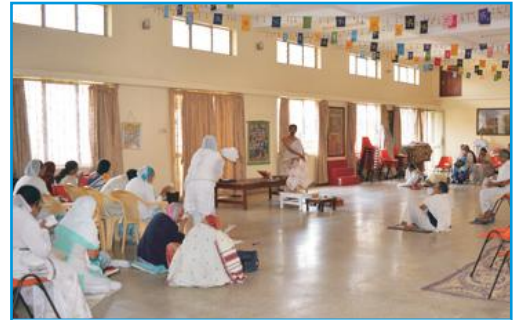
Women Praying at the Temple

This is how we still continue to break this fast, hundred of years later: Arihant, Siddha, Acharya, Upadhyaya, Sadhu, Samyag Darshan ( right faith ), Samyag Gnaan ( right knowledge ), Samyag Charitra ( right conduct ) and Samyag Tapa ( right Austerity ). The first two (Arihant & Siddha) are those who have achieved liberation (Moksha), while the next three are the means to achieve Moksha by using the right faith, knowledge, conduct and austerity.