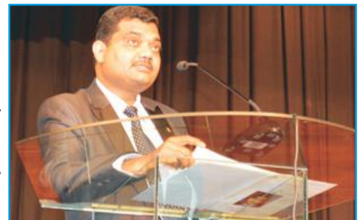
OERB Chairman addressing delegates

The Chairman then proceeded to officially open the 77th Board Adhiveshan.